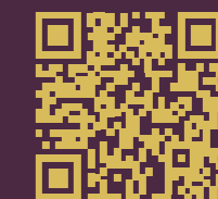
Table Ordering Service